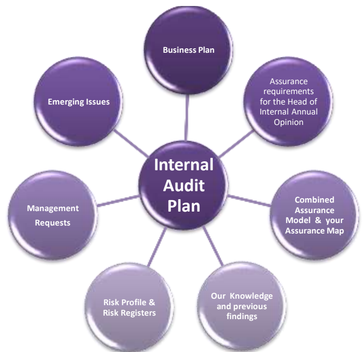
Figure 1 – Key sources of information